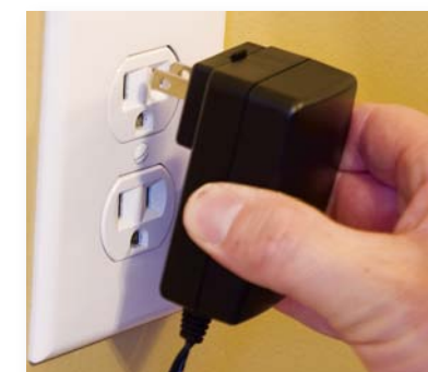
Patented power supply design helps give this iron outstanding performance