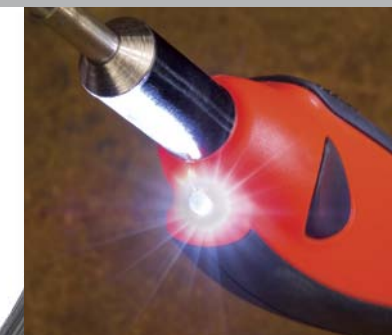
Bright LED illuminates the work, so its easier to make perfect solder joints