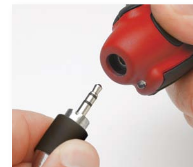
Easy and quick tip change-out with modular plug and rubberized sleeve