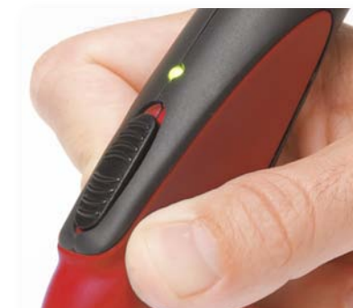
Red power-on LED turns green when iron reaches working temperature