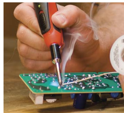
Heats to working temperature three times faster. That's good.

The WPS18MP heats from room temperature to 900°F in just 35 seconds...three times faster than a standard home/hobbyist soldering iron. So there's less time spent waiting for the iron to get up to temperature. People who do a lot of soldering really like that.